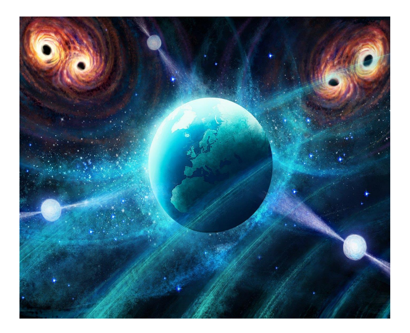
Fig. 2: Artistic Impression of a Pulsar Timing Experiment