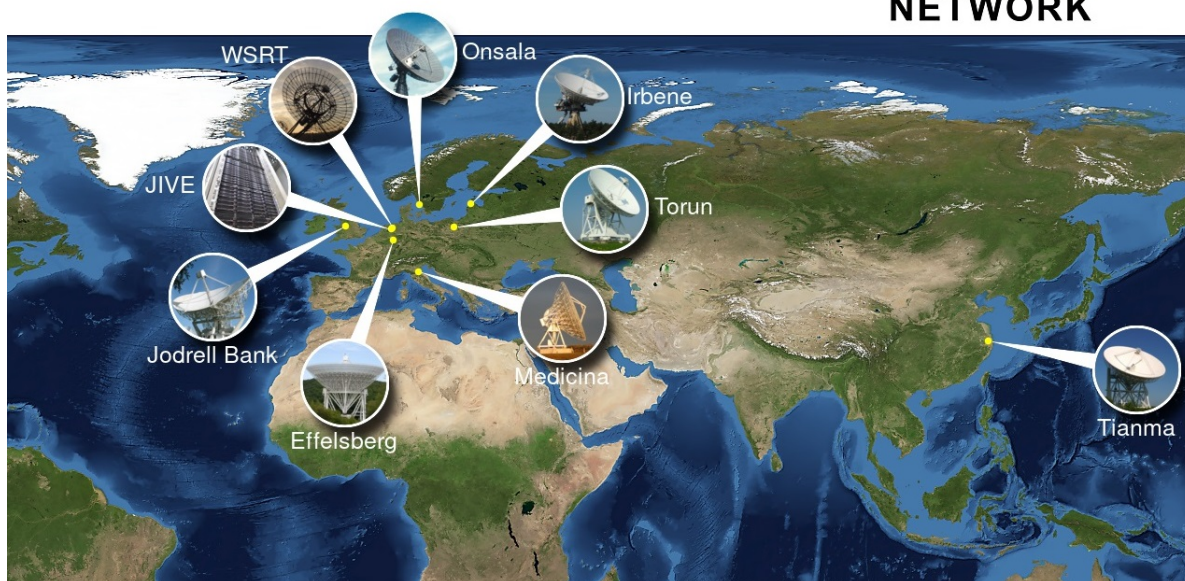
Map of the European VLBI Network (EVN) telescopes used in the observation, showing the positions of the eight participating radio telescopes and also JIVE in The Netherlands.

Credit: Paul Boven (JIVE). Satellite image: Blue Marble Next Generation, courtesy of NASA Visible Earth ( visibleearth.nasa.gov ).