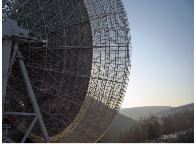
The telescope during regular observations of the Galactic Centre region for unidentified pulsars. The Galactic Centre is in the Sagittarius constellation, which is extremely close to the horizon in the southern direction, and is only visible for approximately 2 hours and 25 minutes every day.